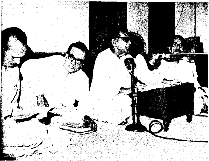
National Professor Dr. Suniti Kumar Chatterji inaugurating the Research Centre